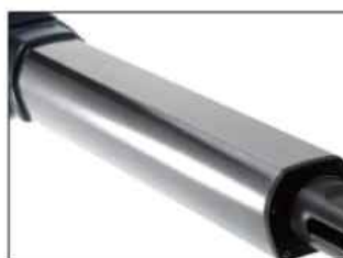
METAL FIXING PLATE