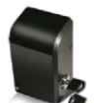
LATCH &amp; STOPPER