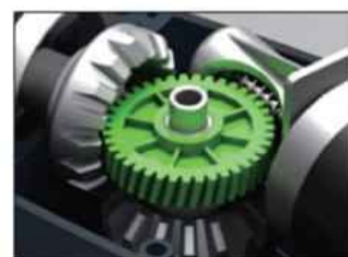
DU PONT WORM GEAR