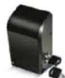
LATCH & STOPPER