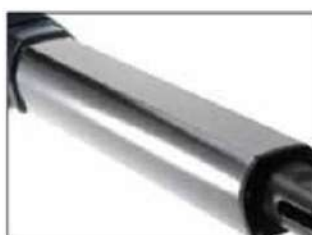
METAL FIXING PLATE