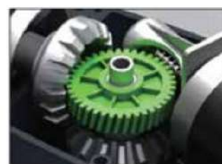
DU PONT WORM GEAR